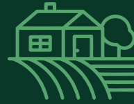
Spacious Farm House